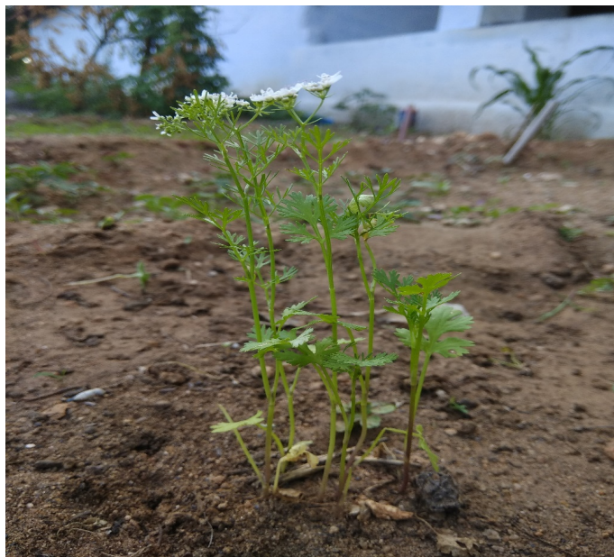
Figure 1. Coriandrum sativum L.

has also been confirmed (Tang et al., 2013). The other chemical components present in the plant have been shown in Figure 2.