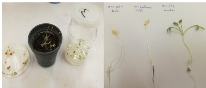
Figure 1. Morphology of Lepidium sativum plant on different growth conditions

The L. sativum plant is an essential edible and medicinal plant. Its growth on the different growth media is shown in Figure 1 inside each medium and outside.